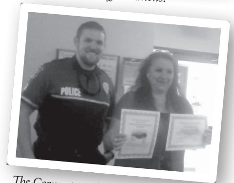
The Cornerstone Apartments once again recertify for Crime Free Housing