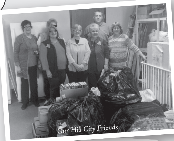
Our Hill City Friends