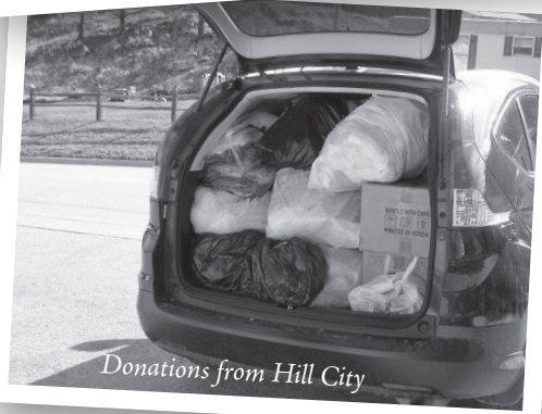
Donations from Hill City