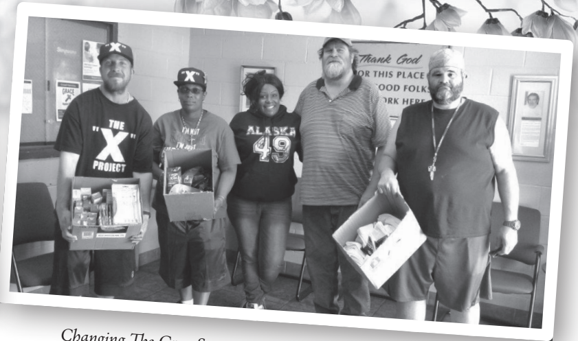
Changing The Gray Street Outreach group drops off donations.